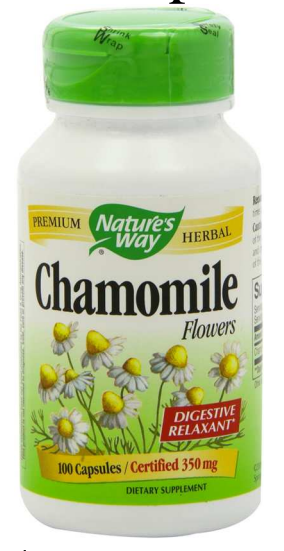
$8.35 per bottle