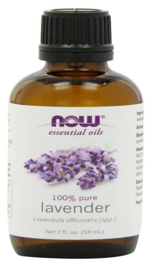
$14.11 per bottle