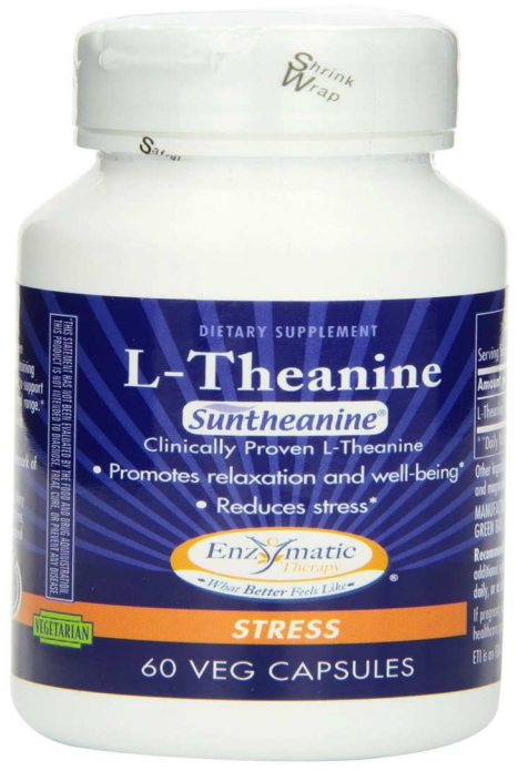
$9.14 per bottle