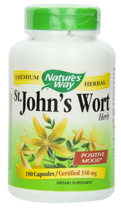
$8.49 per bottle